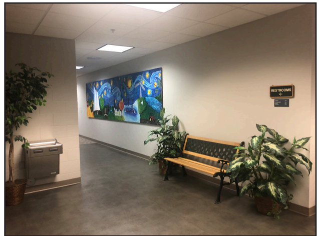
The bathroom on the third floor is located near the museum offices.

I can determine where the bathrooms are by looking at the museum map, following signs, or asking a staff member for help.