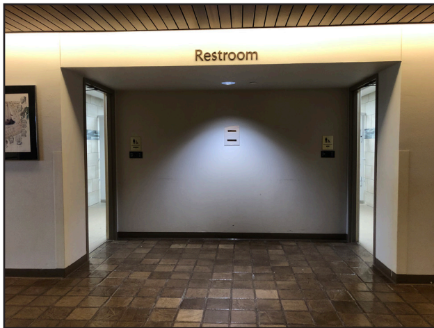
The bathroom on the first floor is located near the gift shop.

I can find the bathrooms next to the gift shop or on the third floor near the museum offices. Drinking fountains are near the elevator on the main floor and third floor.