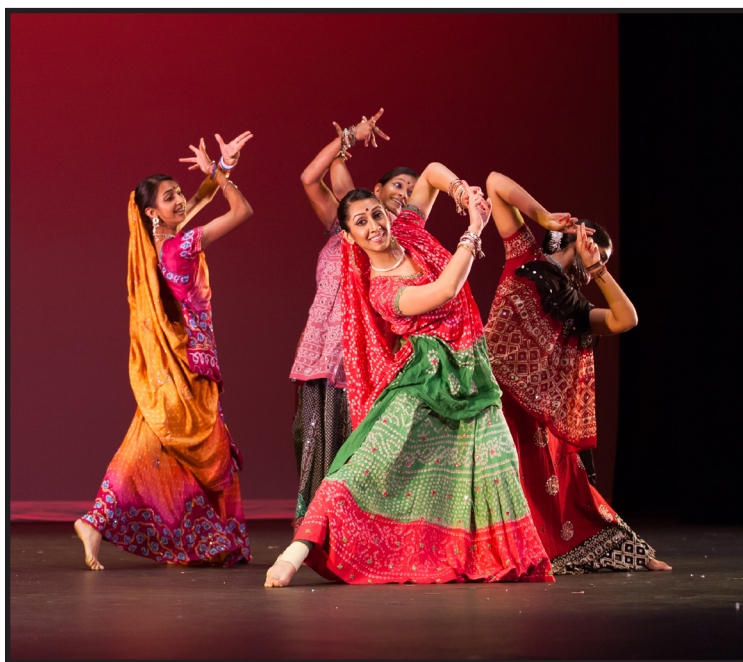
Bollywood dancers from Arpana Dance Company, Irvine, CA.

Learn more with us as we explore this recent migration. The exhibition will be on display at the Hjemkomst